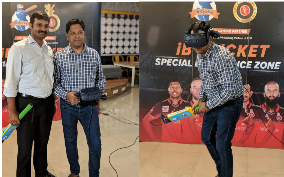
Fun activity(Virtual Reality Cricket) at Edumilestones